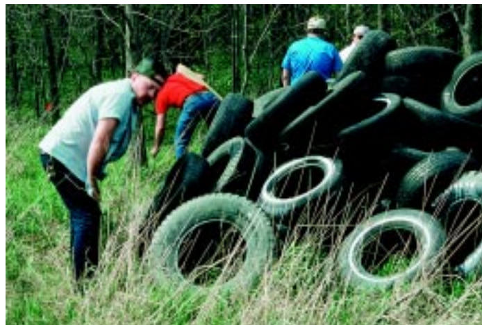
Used tires provide ideal mosquito breeding sites.

The U.S. Geological Survey and the Centers for Disease Control and Prevention are tracking the distribution of the virus in birds, mosquitoes, humans, and other animals. State health departments and university extension personnel may have mosquito control and WNV detection programs for your state.