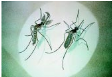
Male (left) and female (right) Culex mosquitoes.