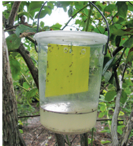
Monitoring trap for SWD. A plastic container with holes, containing a yeast-sugar solution as a bait, and a sticky trap to catch flies. Traps may also be used without the yellow sticky trap if a drop of unscented soap is added to the bait. Count the flies in the liquid weekly and then replace the liquid.

Identification: Some native species of vinegar flies and other insects will be attracted to the traps. These need to be distinguished from SWD flies. Vinegar flies are small (2–3 mm) with rounded golden brown abdomens. Examine the wings of trapped vinegar flies using a 30× hand lens. Some small native flies have dark patches on the wings, but will not have the distinctive dark dot that is present on both wings of SWD males. Female SWD are harder to identify, but this can be done by using a hand lens to examine the ovipositor (see photo). Keep a clear record of the number of SWD detected at each trap site. Given the importance of early detection, it is impera-